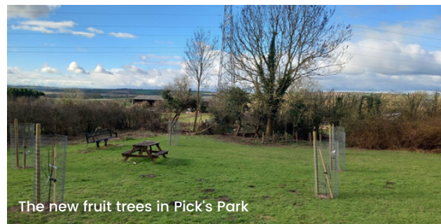
The new fruit trees in Pick's Park