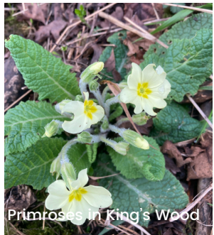
Primroses in King's Wood