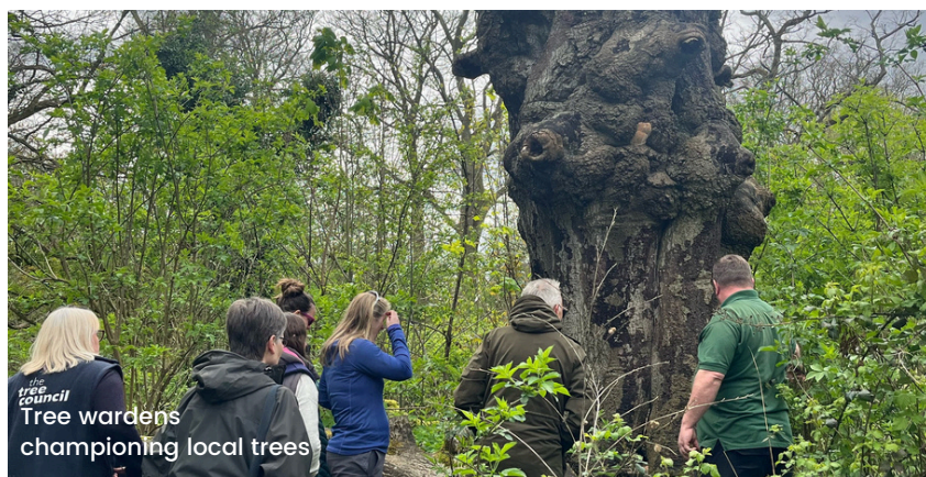
the council Tree wardens championing local trees

TREE WARDENS – Last month saw the relaunch of the Tree Warden scheme at East Carlton Country Park with plenty of enthusiastic volunteers turning up to become our local tree champions. Training will continue in May and June and the good news is it's not too late to join the team. For more information on becoming a tree warden please click the link to the RFV website – tree wardens