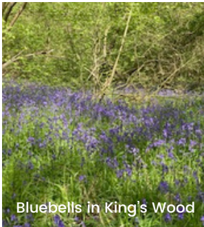
Bluebells in King's Wood