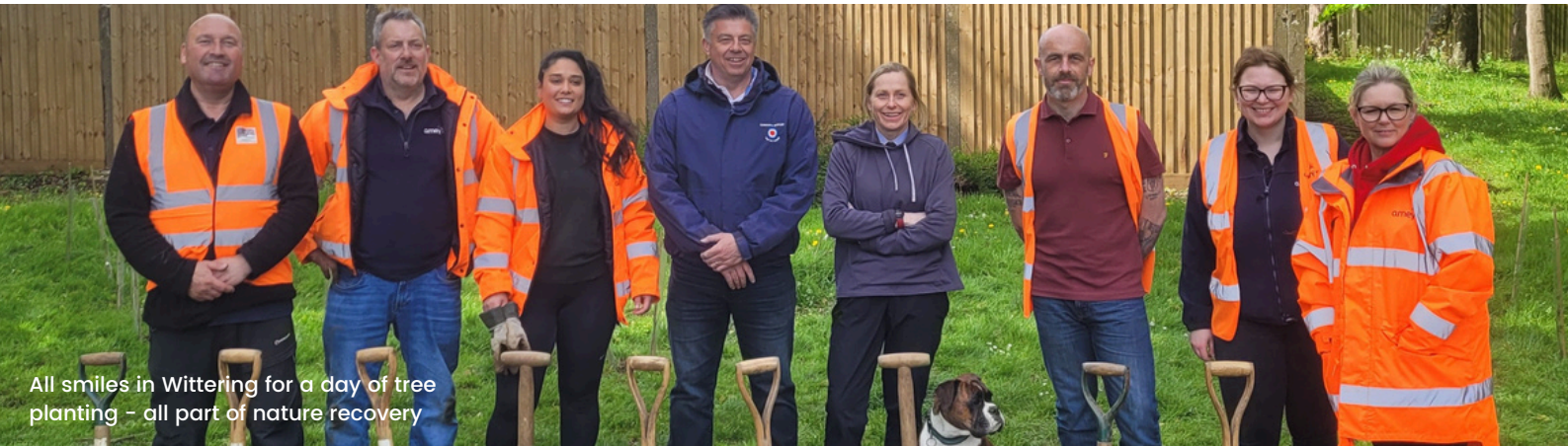
All smiles in Wittering for a day of tree planting – all part of nature recovery