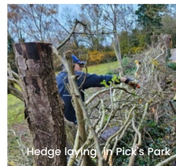
Hedge laying in Pick's Park