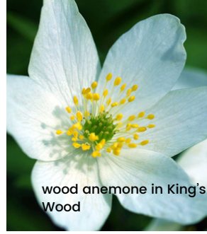
wood anemone in King's Wood